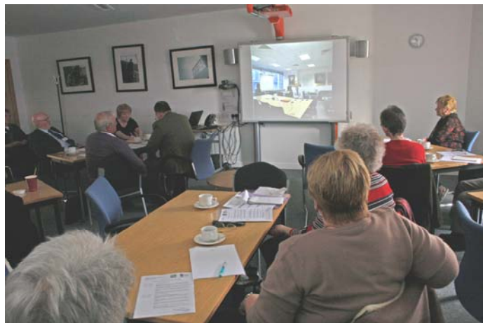
Dumfries and Galloway College