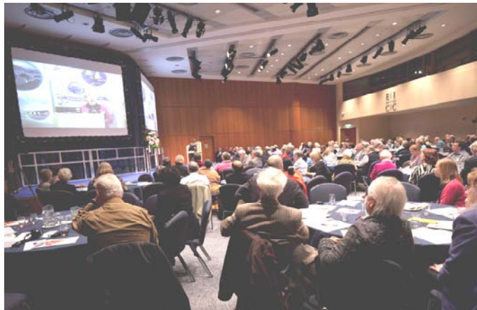
Edinburgh International Conference Centre